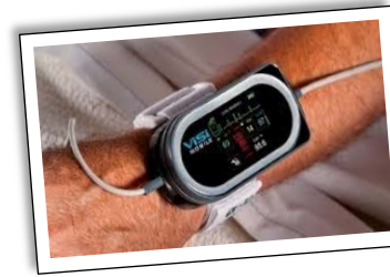
Wireless Device Integration

Sends data to cloud-based, data science partners