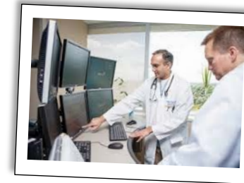
Local and Remote Surveillance